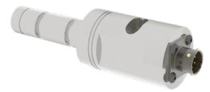
LP Stainless Steel Load Pin

One of the construction contractors, an Interface customer, wanted to find a way to measure the force on the Gerald Desmond Bridge in the event of an earthquake. The goal was to continuously monitor the standard force created by regular traffic, as well as the seismic force before, during, and after earthquakes.