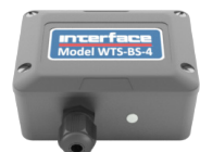
WTS-BS-4 Wireless Base Station USB Interface Industrial Enclosure